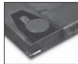
The RL30000W welded seal load cells are recessed within the channel and protected on all sides. SUREFOOT™ supports provide a superior load introduction surface, reducing extraneous forces which might affect scale accuracy.