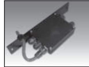
The new NEMA 4 aluminum J-box and sturdy cord grips resist wear and tear.

Heavy Capacity Options/Accessories and Access Ramps and Pit Frames available. See price pages FS-4 (P) and FS-5 (P)